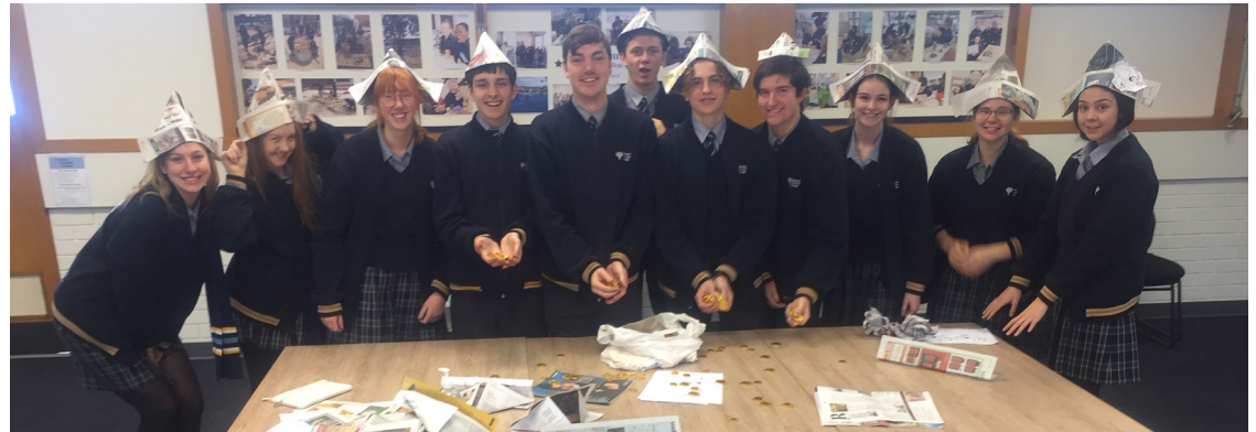
Year 12 Students serving at Brooklyn Park

"Everything. Everywhere. Every moment. That is the scope of God's call on our lives. And that is the dignity our lives enjoy."