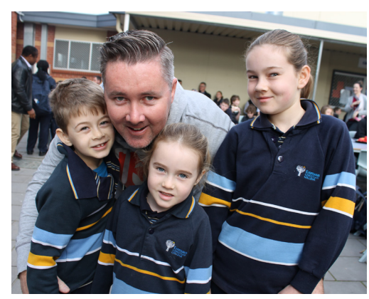
Junior School Theme for Term 3 2017

God is Good all the Time. The Amazing Feast. Week 7 Bible Verse - "Blessed are those who are invited to the Wedding supper of the Lamb!" Revelations 19:9