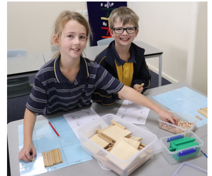
Year 3 Maths - Tens and Ones (Units)