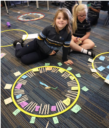
Year 1/2 Maths - Understanding Time