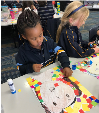
Foundation HASS - All About Me