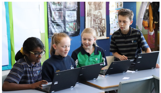
Year 5/6 Indonesian - Quizlet Vocab Development