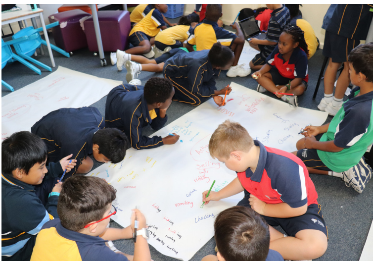
Year 3/4 Literacy - Developing Vocabulary