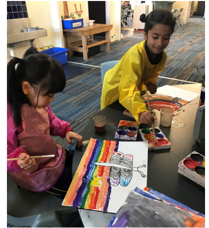
Year 1 Visual Arts - Line and Shape