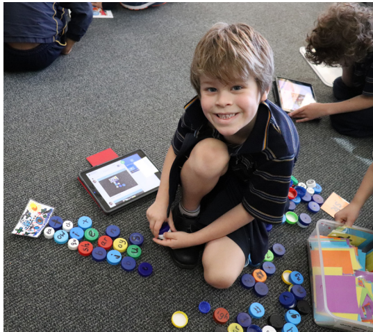
Year 2 Literacy - Spelling