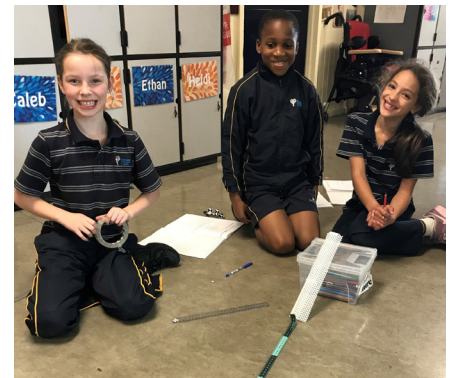
Year 3/4 Science - Investigating Friction